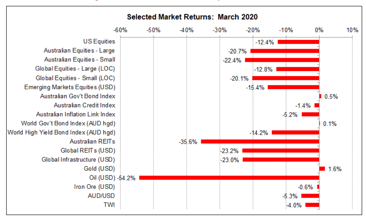
Chart 1: A dramatic month for global markets in a world rocked by Covid-19

Source : Thomson Reuters, Bloomberg 1 April 2020